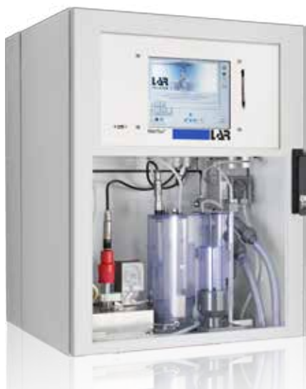
Highly sensitive bacteria in a robust analyser.

NitriTox continually checks incoming waste water for pollutants. Additionally, the reaction of highly sensitive nitrifiers to potential toxins in water is determined and that within an measurement interval of just 5 minutes.